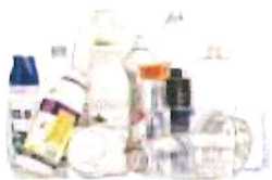
Plastic Bottles and Containers #1-7