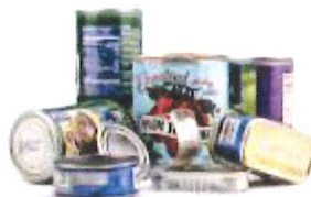
Aluminum, Tin, and Steel Cans