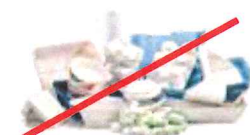
No Foam Cups, Containers, Napkins, or Paper Towels

To Learn More Visit: RecycleoftenRecycleright.com