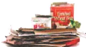
Flattened Cardboard And Paperboard