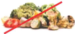
No Food Waste