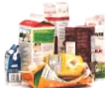
Food and Beverage Cartons